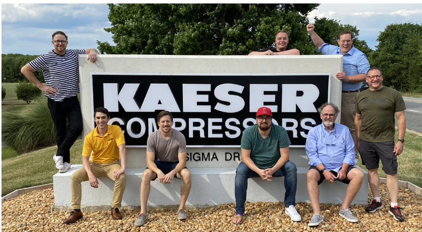
Kaeser Compressors Staff

to a future generation—and help demonstrate the importance of philanthropy in our community. Thank you for giving back and making a difference.